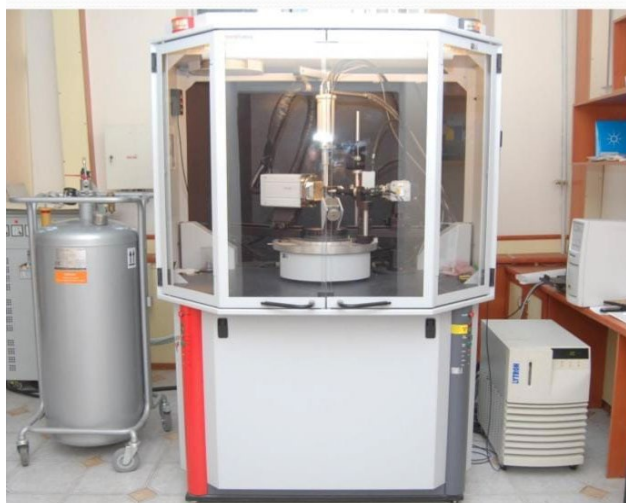
Fig. 1 APEX-II Advance X-ray diffractometer

laboratories of the university and partner organizations are equipped with modern equipment and meet the requirements for conducting research work.