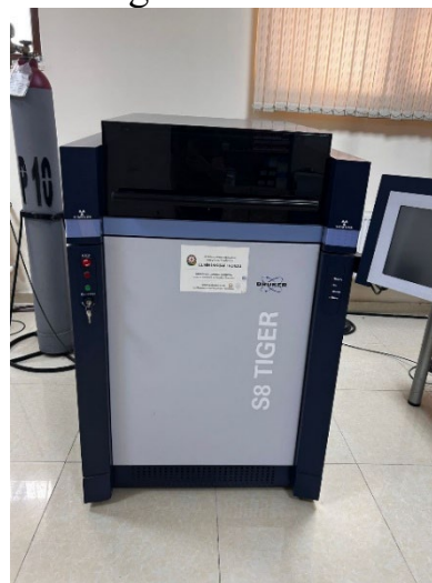
Fig. 2 S8 TIGER X-ray fluorescence analyzer

Within the credit-based education system, master's students have the opportunity to design their own individual educational path. With the support of an academic advisor, an individual study plan is developed annually for each master's student, as evidenced by the submitted documents. Master's students can choose elective courses and, where possible, instructors, which ensures flexibility in the educational process and fosters the development of academic independence.